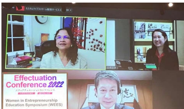
"Supporting Women Entrepreneurs" pitch event (March 8th, 2022)