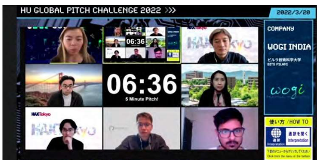
HU Global Pitch Challenge by BITS Pilani, Hiroshima University, HAX Tokyo, and SOSV in India